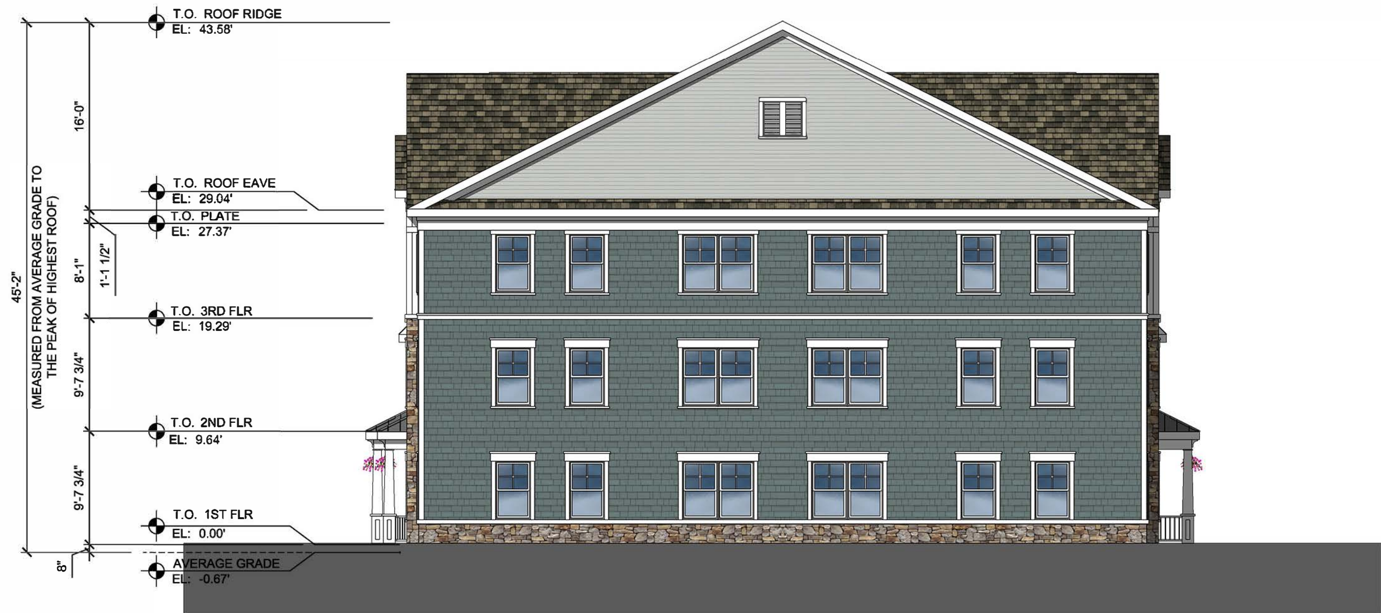
4 - LEFT SIDE ELEVATION Scale: 1/8" = 1'-0"