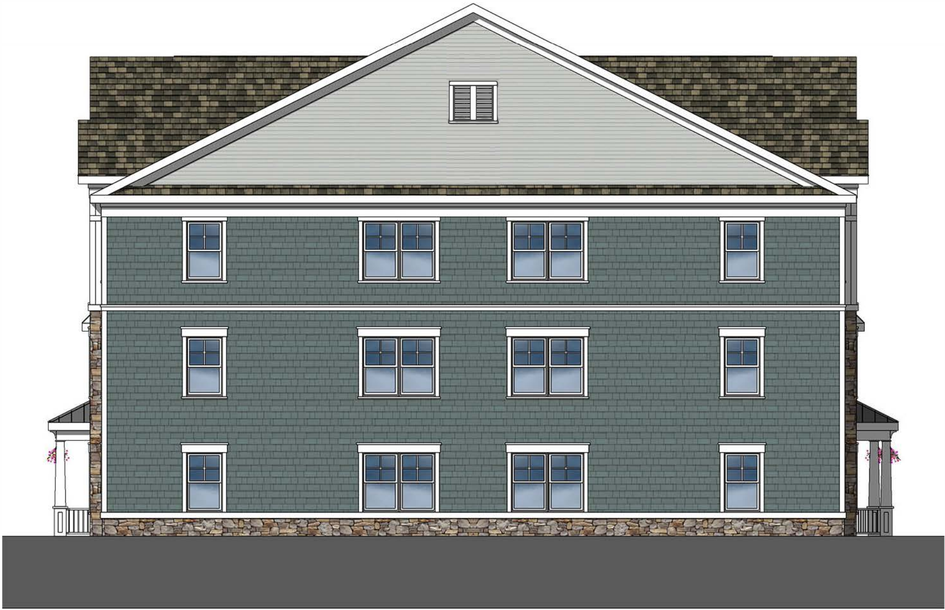
2 - RIGHT SIDE ELEVATION Scale: 1/8" = 1'-0"