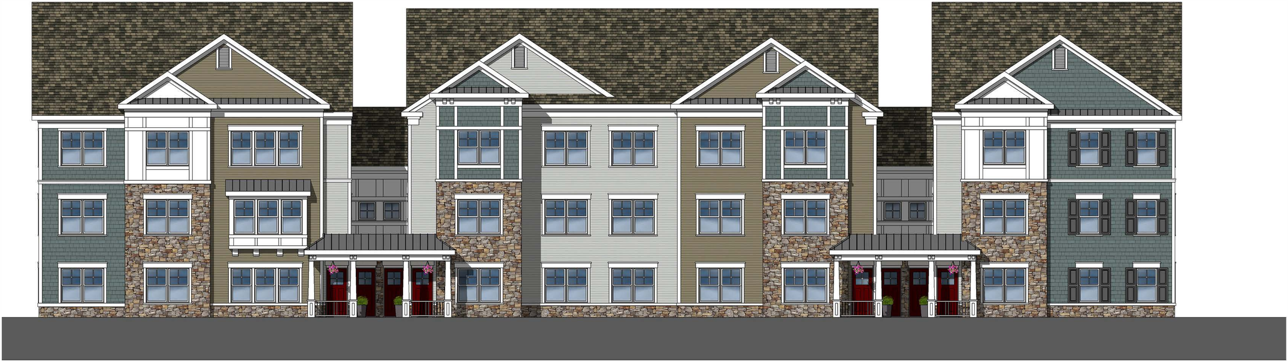
3 - REAR ELEVATION Scale: 1/8" = 1'-0"